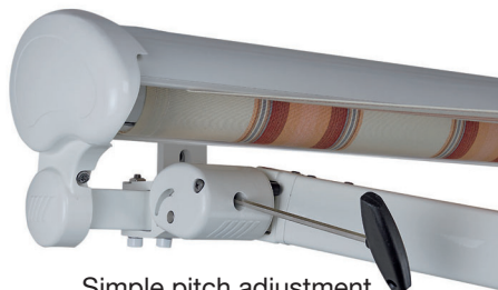
Simple pitch adjustment

The Contego TS provides long-lasting durability, resilience and resistance to weathering.