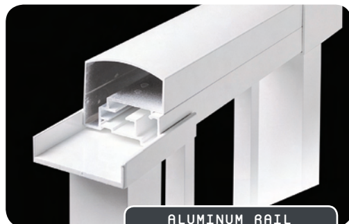
ALUMINUM RAIL CUT-AWAY SHOT