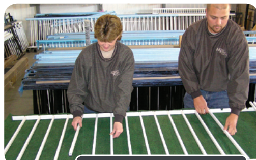
ALUMINUM RAIL ASSEMBLY