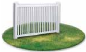
Universal 3.5" 3' and 4' heights with 3.5" spacing.