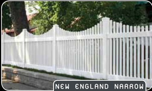
NEW ENGLAND NARROW PICKET SCALLOPED