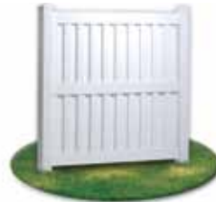
Panel Privacy 4', 5' and 6' heights with a recessed panel look