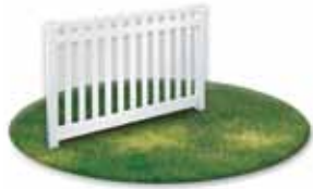
Wide Straight - 3" Spacing 3', 3.5' and 4' heights with 3" spacing.