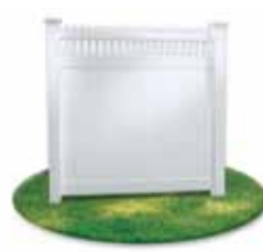
6" T&G Privacy with New England Straight Topper Available in 6' height.