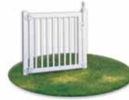
Universal Gate Shown with tru-close hinges and magna latch. (Bolt-on hinge also available)