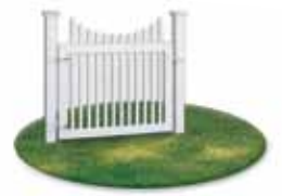
New England Picket Gate Shown with stainless steel bolt-on hinges and thumb latch. (Tru-close hinge also available)

All gates come with standard hardware. Post stiffeners are recommended for all gate installations