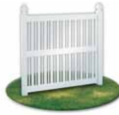
Alternating Uprights Available in 4', 5' and 6' heights.