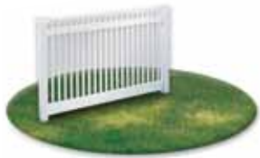
Narrow Straight - 2" Spacing 3', 3.5' and 4' heights with 2" spacing.