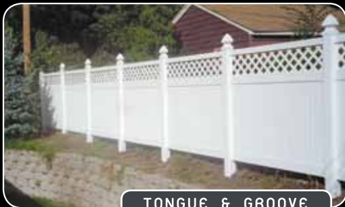
TONGUE & GROOVE WITH LATTICE TOP