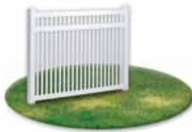
Universal 3.5" Extended 5' and 6' heights with 3.5" spacing.