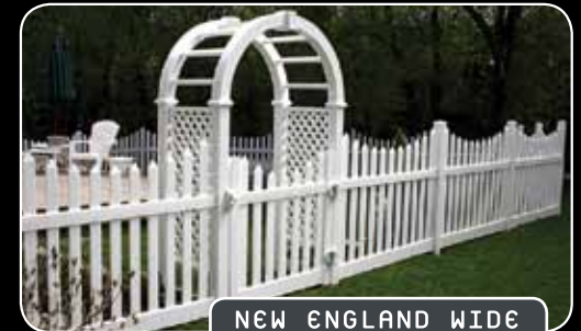
NEW ENGLAND WIDE PICKET SCALLOPED