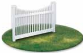
Narrow Scalloped - 2" Spacing 3'-3.5', 3.5'-4' and 4'-4.5' heights with 2" spacing.