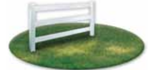
Three-Rail Rails are set 11" apart. Available in 5" x 6.5', 5" x 7' and 5" x 7.5' posts.