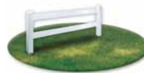
Two-Rail Rails are set 11" apart. Available in 5" x 5' and 5" x 6' posts.