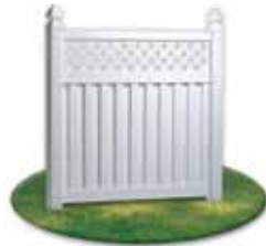
Panel Privacy with Lattice 4', 5' and 6' heights with a recessed panel look and two lattice options