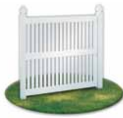
Uniform Uprights Available in 4', 5' and 6' heights.