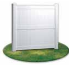
6" T&G Privacy (3or2 Rail) 3-rail system offered in 5' and 6' heights with optional lattice. 2-rail system offered in 4', 5' and 6' heights with optional lattice.