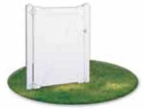
Field Adjustable Gate Kit Shown with tru-close hinges and pro double lock latch. (Bolt-on hinges also available)

All gates come with standard hardware. Post stiffeners are recommended for all gate installations