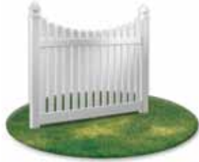
Wide Scalloped - 1/2" or 3" Spacing 3'-3.5' & 3.5'-4' with 3" spacing. Also 4.5'-5' & 5.5'-6' heights with 1/2" spacing.